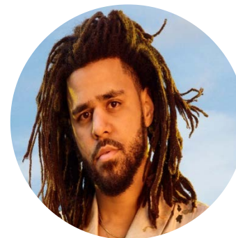
J Cole Hip Hop artist