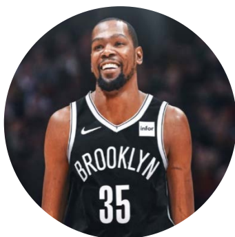
Kevin Durant NBA Champion