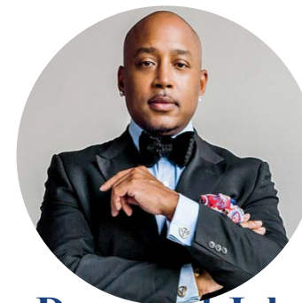
Daymond John Entrepenuer/Star Of ABC Shark Tank

Please note that the listed speakers & performers are subject to change